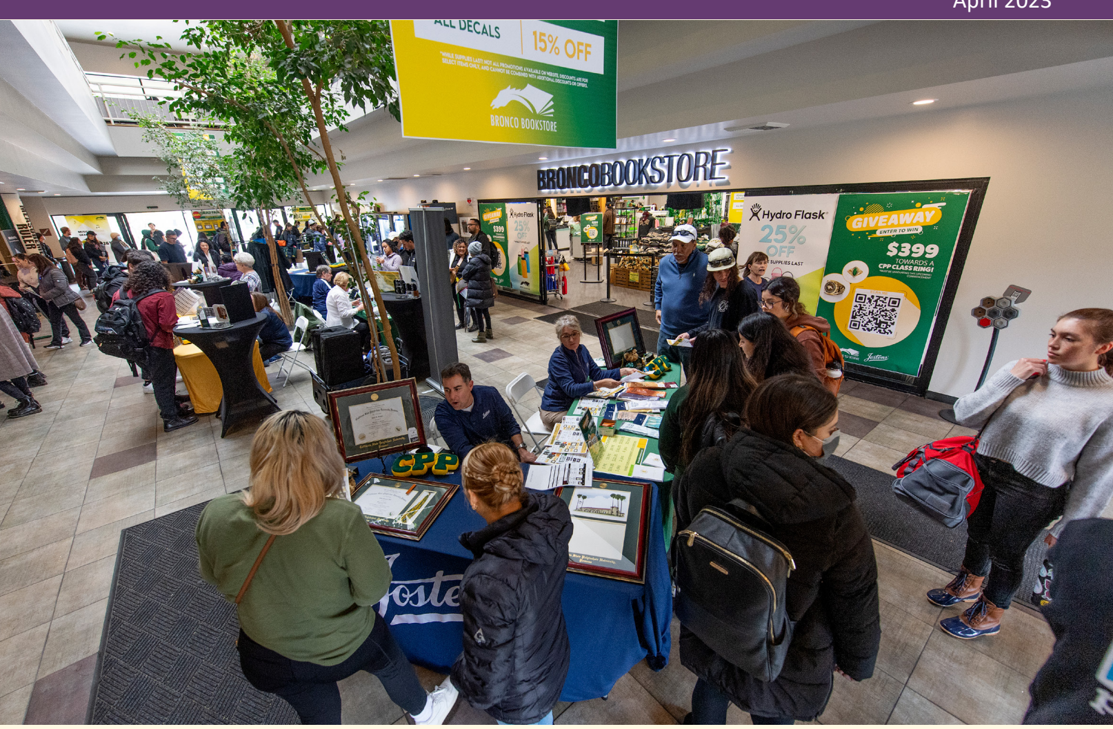
Bronco Bookstore hosts Grad Fair! Read more on page 11